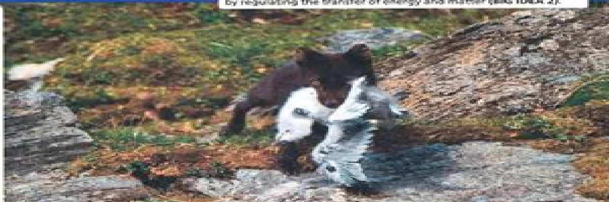
Figure 55.1 This arctic fox ( Vulpes lagopus ) will obtain chemical nutrients and energy when it eats the seabird it has killed. Before its death, the seabird ate fish from the sea and excreted waste that provided key nutrients for the plants on this Alaskan island. These interactions illustrate a few of the many ways that chemicals and energy move through ecosystems.