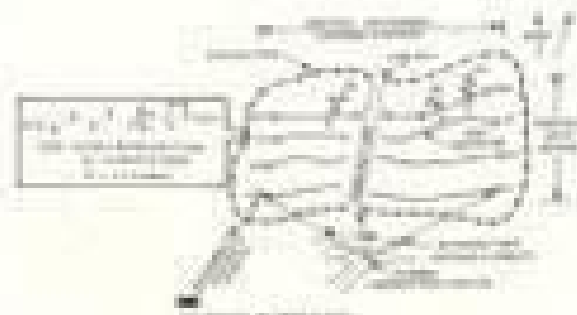
© 2006 The Authors Journal compilation © 2006 Blackwell Publishing Ltd