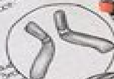
Maxillary premolar forceps (Upper 1st & 2nd molar)

The beaks of the forceps are of same size. The beaks are long and thin point. The beaks are longer than the handle. The beaks are shorter than the working arm.