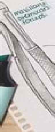
maxillary premolar forceps