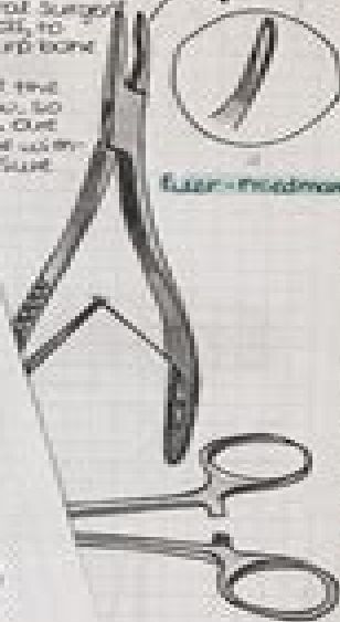
maxillary molar forceps