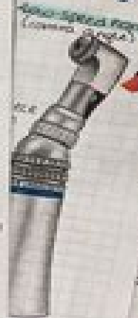
maxillary molar forceps