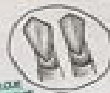
Mandibular premolar forceps