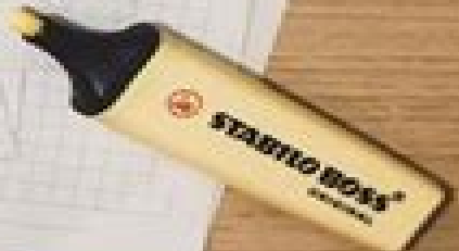
maxillary molar forceps