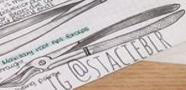
Maxillary right hip forceps

These have a slightly curved shape. It is the beaks of the forceps that are longer than the handle. The beaks are shorter than the working arm.