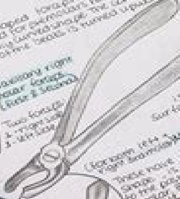
Maxillary right molar forceps (Upper & second)