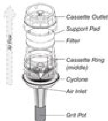
Figure 1 Exploded view of the cyclone/filter cassette assembly