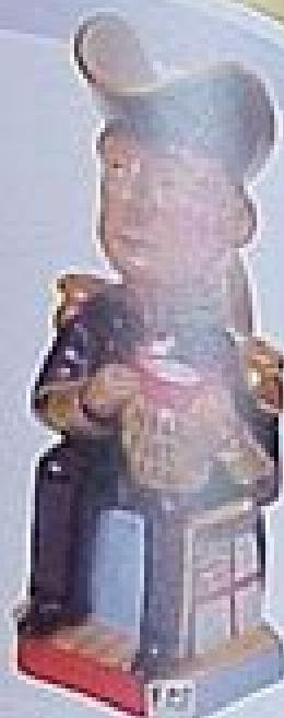
A Wilkinson Toby Jug, designed by Sir Francis Carruthers Gould, in the form of Admiral John Jellicoe, mounted 'The Iron Jack', 1920, 100mm (3 7/8 in) high.