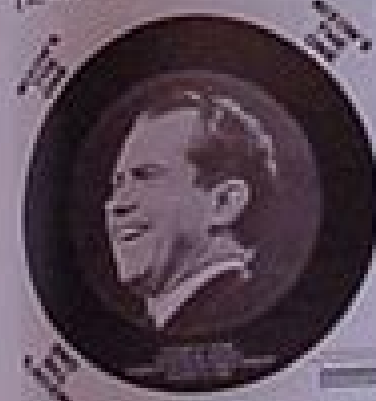
A Richard Nixon presidential campaign portrait mug, featuring a portrait of Nixon, 1968, 115mm (4 1/2 in) high.