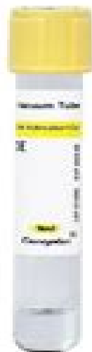
vacuum blood collection tube