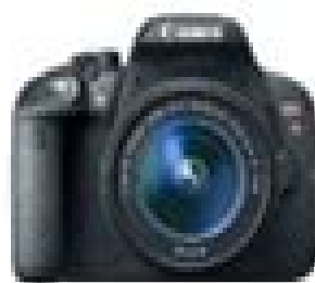
Canon EOS Rebel T5i Digital SLR with...