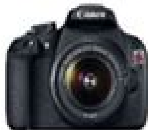
Canon EOS Rebel T5 EF-S 18-55mm IS II...