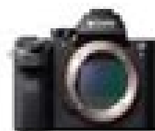
Sony ILCE7SM2/B Full-Frame Mirrorless...