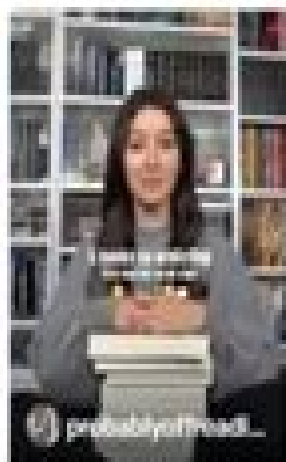
A few recent books I've