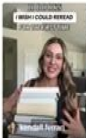
10 books I wish I could