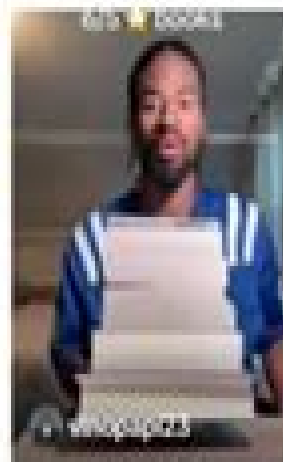
These books shattered