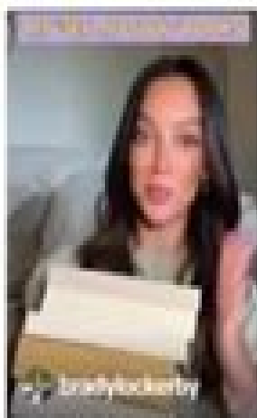
books I would sell my