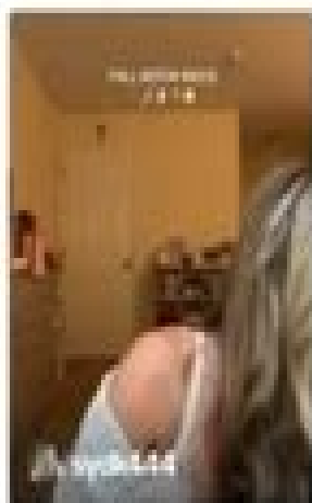
Rainy day & fall book