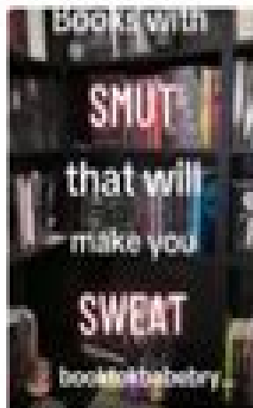
Smutty books are the