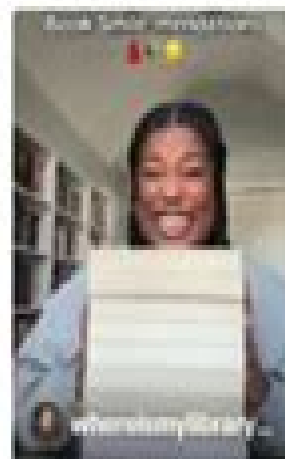
shoutout to all the freida