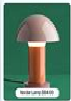
Modern lamp ($149)