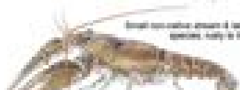
Orconectes obscurus Hogback Crayfish max. carapace length 150mm