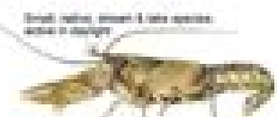
Orconectes propinquus Northern Copper Crayfish max. carapace length 150mm