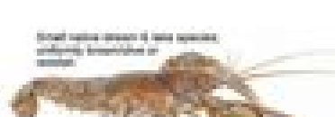
Cambarus bartoni Common Crayfish max. carapace length 150mm