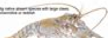
Cambarus robustus Big Water Crayfish max. carapace length 150mm