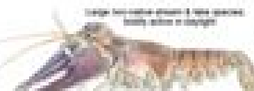
Orconectes rusticus Rusty Crayfish max. carapace length 150mm