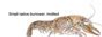
Fallicambarus fodiens Copper Crayfish max. carapace length 150mm