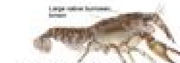
Cambarus diogenes Dwarf Crayfish max. carapace length 150mm