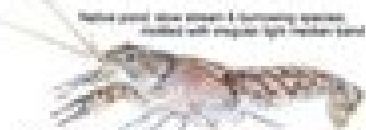
Orconectes immunis Golden Crayfish max. carapace length 150mm