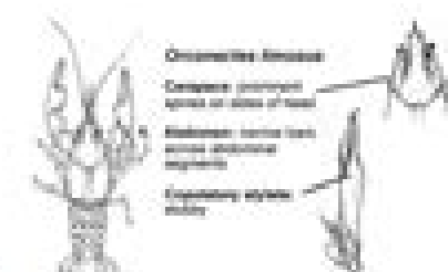
Orconectes limosus Common Crayfish max. carapace length 150mm

Orconectes limosus Carapace: prominent brown, with white spots Abdomen: jointed, brown with white segments Respiratory apophysis: straight