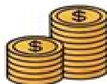
Debt Management Tools