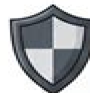
Identity Theft Protection