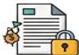
Credit Monitoring Services