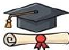
Student Loan Trackers