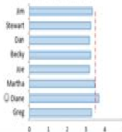
Satisfaction Score - By Agent