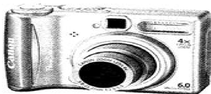
Photo of PowerShot A540