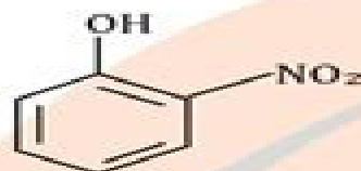
o - Nitrophenol