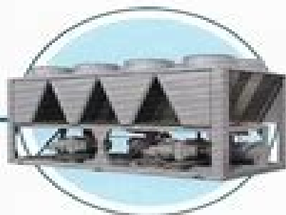
30XA & 30XAV