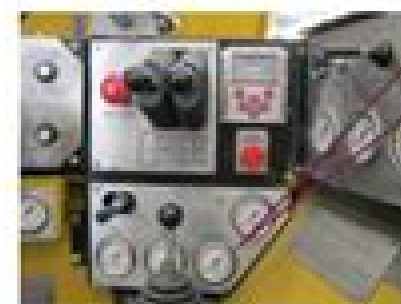
PHL-10/15 and MH-40 Hydraulic Connection Points in Off-Off