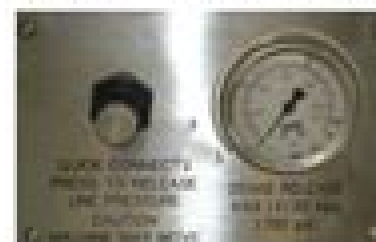
PHL-10/15 and MH-40 Hydraulic Connection Points in Off-Off