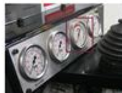
PHL-10/15 and MH-40 Hydraulic Connection Points in Off-Off