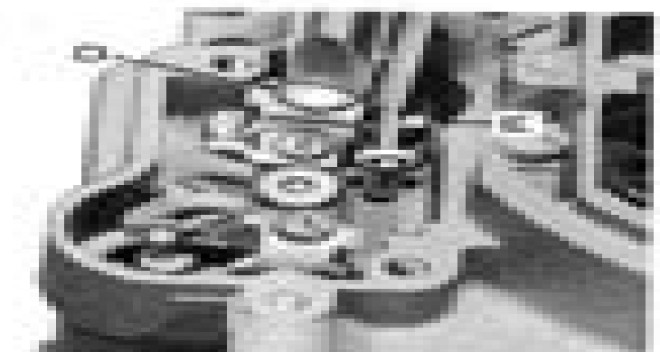
Figure 4 Plant Specimen