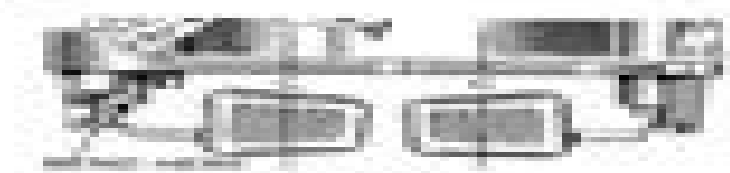
Figure 3 Plant Specimen