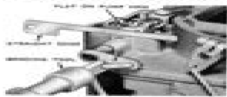
Figure 2 Plant Specimen