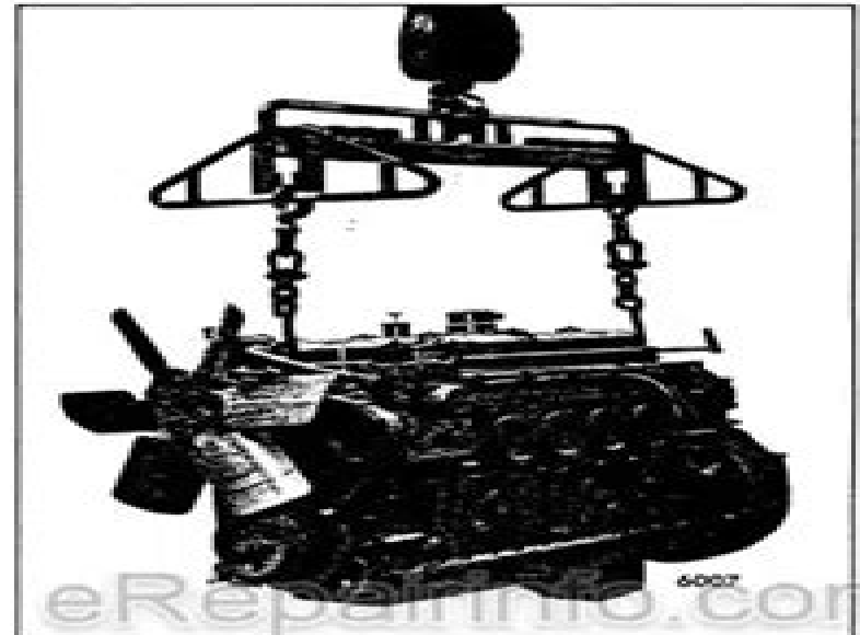
Fig. 6 - Lifting Engine with Spreader and Sling

necessary clearance for the front balance weight cover and the flywheel housing when the engine is tipped on its side and rotated.