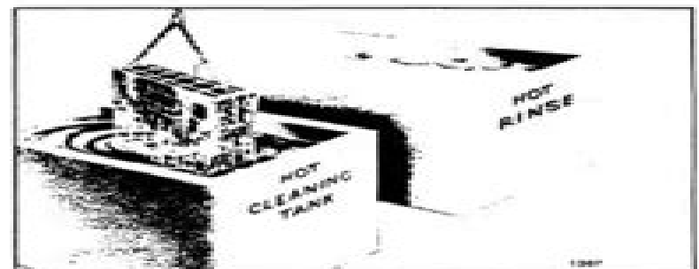
Fig. 7 - Cleaning Cylinder Block

17. Loosen the locknuts on the two holding lugs on the adaptor plate and lower the engine while guiding the lugs into the air box openings.