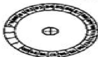
Mexican Army Cipher Disk #5