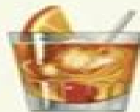
WHISKY FIZZ 1 oz. Whisky 1 oz. Lemon Juice 1 oz. Simple Syrup 1 oz. Soda Water Dash of Angostura Bitters