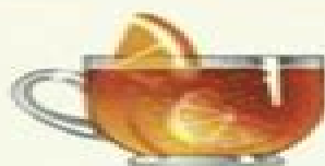
FRUIT PUNCH 1 oz. Fruit 1 oz. Simple Syrup 1 oz. Soda Water Dash of Angostura Bitters