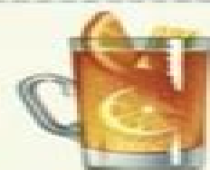
FRUIT PUNCH 1 oz. Fruit 1 oz. Simple Syrup 1 oz. Soda Water Dash of Angostura Bitters