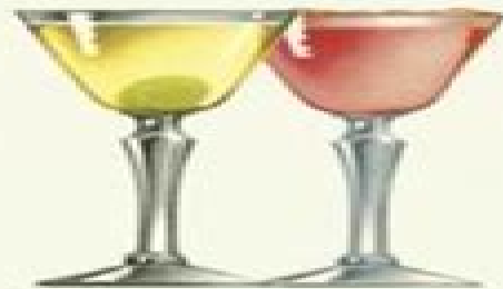
GIN LEMON 1 oz. Gin 1 oz. Lemon Juice 1 oz. Simple Syrup 1 oz. Soda Water Dash of Angostura Bitters