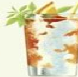
WHISKY JAZZ 1 oz. Whisky 1 oz. Lemon Juice 1 oz. Simple Syrup 1 oz. Soda Water Dash of Angostura Bitters