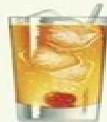
WHISKY SODA 1 oz. Whisky 1 oz. Soda Water Dash of Angostura Bitters