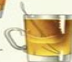
OLD FASHIONED WHISKY 1 oz. Whisky 1 oz. Simple Syrup 1 oz. Bitters Dash of Angostura Bitters