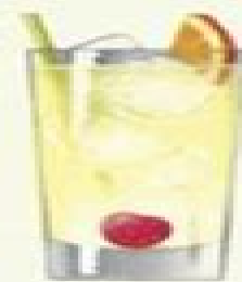
GIN TONIC 1 oz. Gin 1 oz. Tonic Water Dash of Angostura Bitters