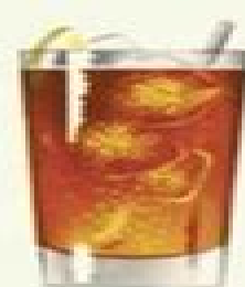
GIN AND TONIC 1 oz. Gin 1 oz. Tonic Water Dash of Angostura Bitters