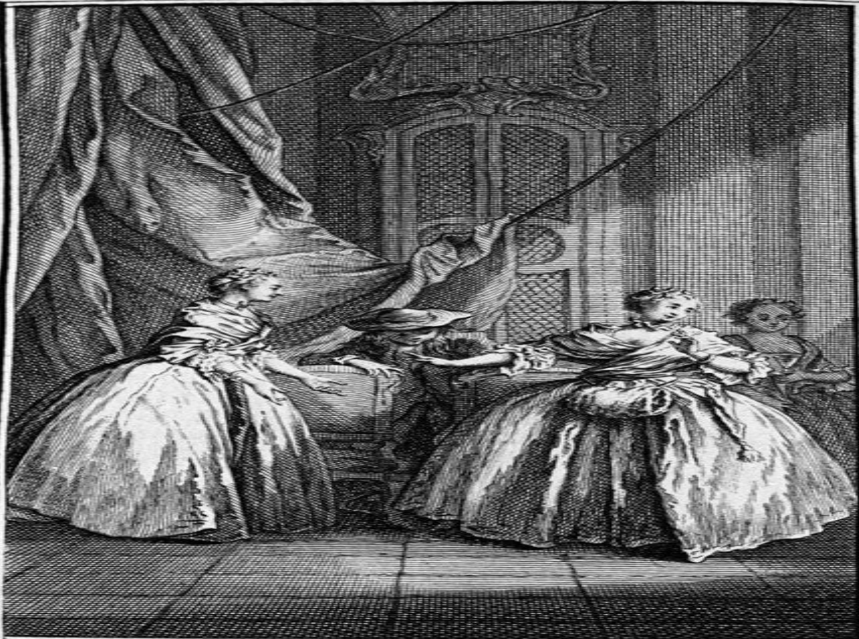
LA COMTESSE DESCARBAGNAS.