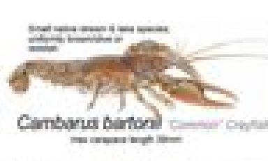
Cambarus bartoni Common Crayfish max carapace length 100mm