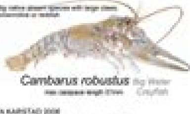
Cambarus robustus Big Water Crayfish max carapace length 150mm