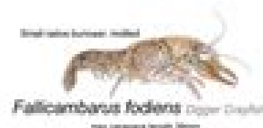
Fallicambarus fodiens Digger Crayfish max carapace length 100mm