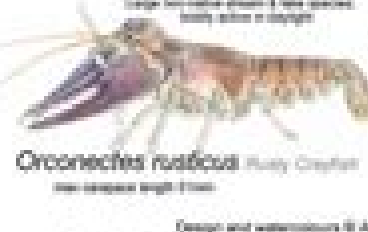
Orconectes rusticus Rusty Crayfish max carapace length 150mm

Orconectes rusticus Rostrum: white, curved Chelae: smaller, with a dark and light banding Carapace: brown, with white, transverse stripes Respiratory apophysis simple