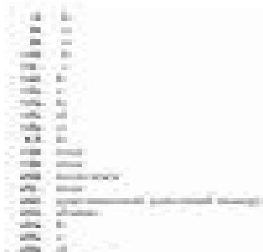
Figure 18.2: Other Storage: Storage and Storage