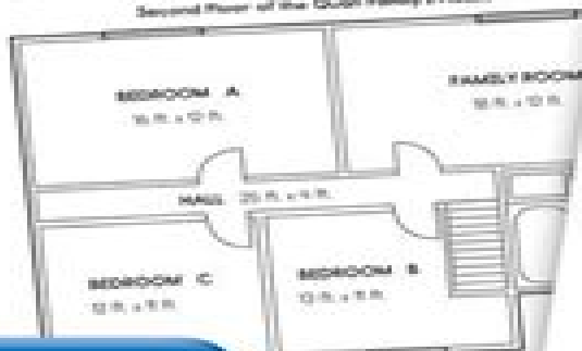
Second Floor of the Quon Family's House

1. How many bedrooms are there? 2. Is the family room larger than bedroom A? 3. What is the area of the 3 bedrooms total? 4. How many bathrooms are there? 5. How many closets are there? 6. How many doors are there? 7. How many windows are there? 8. How many stairs are there? 9. How many doors are there between the largest and smallest rooms? 10. How many doors are there between the largest and smallest rooms?