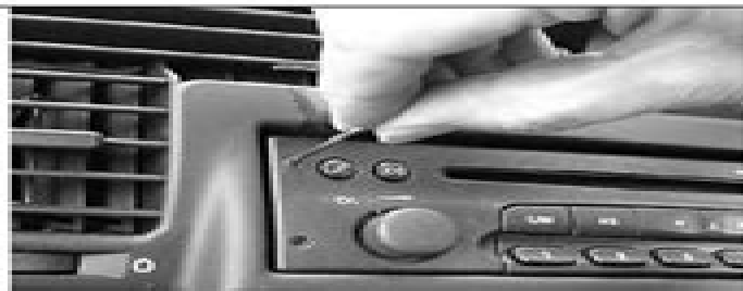
Use small Allen key to remove grub screws

The following guide shows step by step guide to installing an iO_Connect into a 2005 Zafira with CDR500 radio.