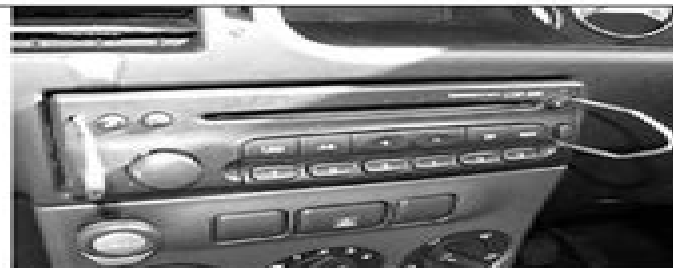
PC5-83 extractor keys to remove radio