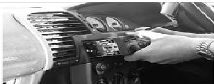
Ensure you know the radio code, pull the radio out.