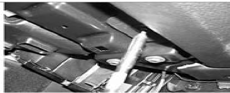
Remove lower panel, then screws in 3 places.