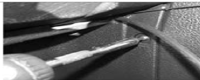
Remove side panel to left of centre console.