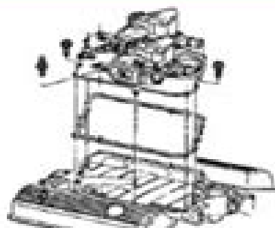
1968 and later TBI plate insulation

14. If the upper alternator or air condi-