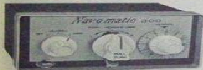
300 CONTROLLER AMPLIFIER PART NO. 28670-1214 (14 VDC) PART NO. 28670-1228 (28 VDC)