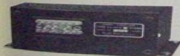
OMNI COUPLER NAV-O-MATIC 300 PART NO. 28900