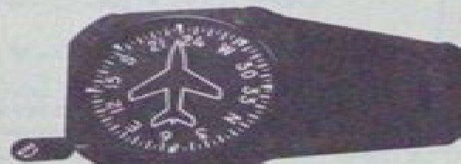
DIRECTIONAL GYRO NAV-O-MATIC 300 PART NO. 30370-0100