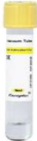
vacuum blood collection tube