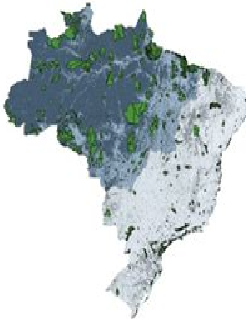
A. Protected Areas in 1997