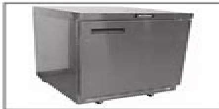
4500 Series Work-top and undercounter freezer bases