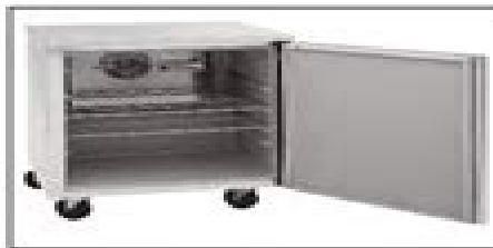
400 Series Work-top and undercounter refrigerator or freezer bases

Please read this manual completely before attempting to install or operate this equipment! Notify carrier of damage! Inspect all components immediately. See page 2.