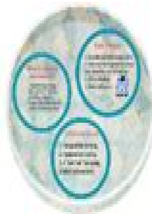
Compare and Contrast in a Nutshell