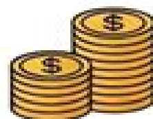
Debt Management Tools