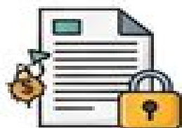
Credit Monitoring Services