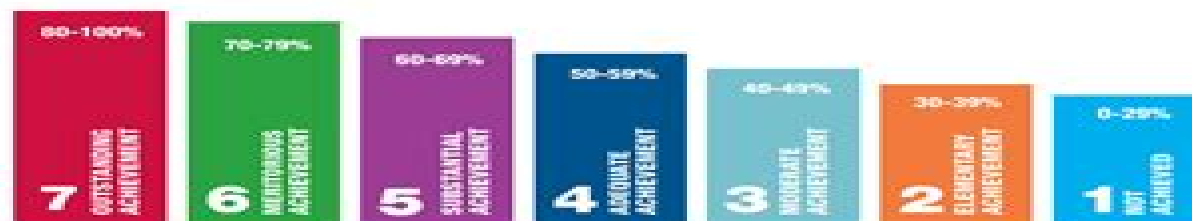
TABLE A – National Curriculum Statement and NCV Group A subject rating

Please note that some of the qualifications listed here may be replaced by HEQSF aligned qualifications and the admission requirements may therefore differ between the existing qualification and the HEQSF aligned qualification.