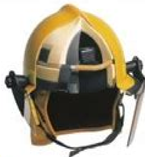
Close-up of Bannan Product Note: © 2013 Courtesy of NFPA - The Safety Company.