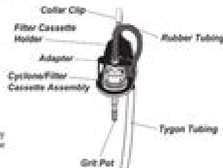
Figure 3 Cyclone with filter cassette in holder