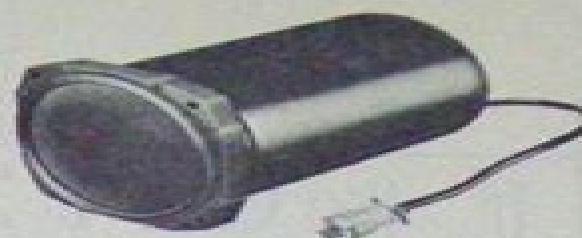
RATE GYRO NAV-O-MATIC NAV-O-MATIC 200 NAV-O-MATIC 300 PART NO. 50320 (14 VDC) PART NO. 29520 (28 VDC)