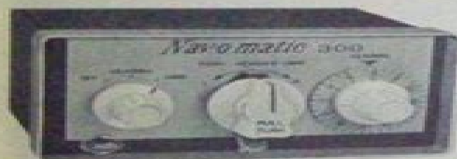
300 CONTROLLER AMPLIFIER PART NO. 28670-1214 (14 VDC) PART NO. 28670-1228 (28 VDC)