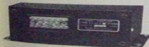
OMNI COUPLER NAV-O-MATIC 300 PART NO. 28900