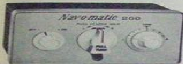
200 CONTROLLER AMPLIFIER PART NO. 30340-1114 (14 VDC) PART NO. 30340-1128 (28 VDC)