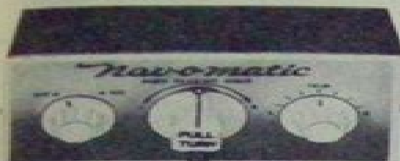
BASIC CONTROLLER AMPLIFIER PART NO. 50330 (NO LONGER AVAILABLE REPLACE WITH 30340-1114)