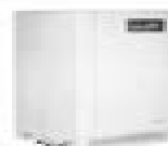
EDP700Plus (12 - 30 kVA)

Temperature compensated charging eliminates the possibility of thermal runaway.