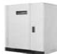
EDP750 L (80 - 250 kVA)