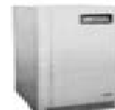
EDP700Plus (50 - 80 kVA)