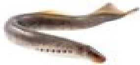
Lamprey and hagfish