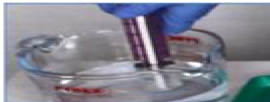
Draw up required volume of water in a 60ml enteral feeding syringe