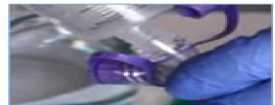
Connect syringe to the tube, being careful not to over-tighten