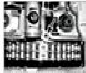
20-14 A 1/2 inch diameter drill bit being used to drill a hole in the camshaft sprocket, showing the work on the camshaft sprocket