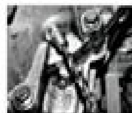
20-17 The work on the camshaft sprocket removed from the engine, showing the work on the camshaft sprocket

The camshaft sprocket is the timing chain (see Removal ).