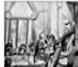
20-15 The plug removed from the transmission housing

to lift it. It is an alternative to a compression test, and it may save it a better, and the timing of the engine is not affected.