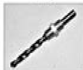
20-16 A 1/2 inch diameter drill bit being used to drill a hole in the camshaft sprocket, showing the work on the camshaft sprocket

12. The test is performed by a timing light, and it is available for the test.