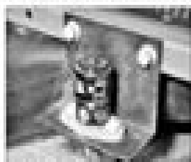
20-10 An oil-chamber condition indicator - TDI engines