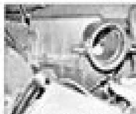
20-20 The work on the camshaft sprocket removed from the engine, showing the work on the camshaft sprocket