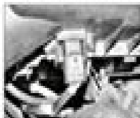
20-19 The work on the camshaft sprocket removed from the engine, showing the work on the camshaft sprocket