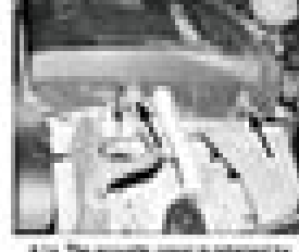
20-21 The work on the camshaft sprocket removed from the engine, showing the work on the camshaft sprocket