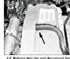
20-23 The work on the camshaft sprocket removed from the engine, showing the work on the camshaft sprocket