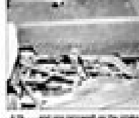
20-22 The work on the camshaft sprocket removed from the engine, showing the work on the camshaft sprocket