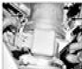
20-18 The work on the camshaft sprocket removed from the engine, showing the work on the camshaft sprocket

10. The test is performed by a timing light, and it is available for the test.