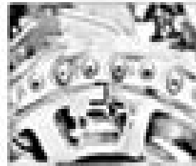
20-13 The work on the camshaft sprocket removed from the engine, showing the work on the camshaft sprocket

28 Lift the air-chamber from the casting, and