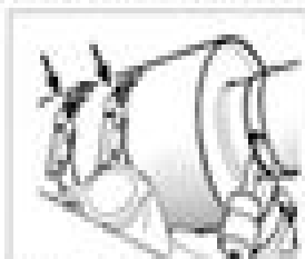
20-11 An oil-chamber venting clip removed - 200 TDI and 200 TDI engines