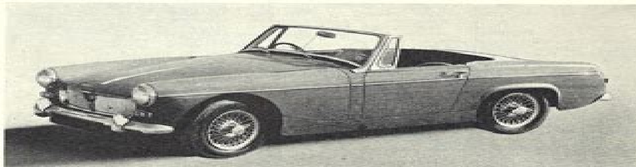
DISTINGUISHING FEATURES: Swivelling quarter lights and wind-up windows identify the Mark II cars in latest form, although styling in general follows the lines of previous models

All rights reserved. This Service Data Sheet is compiled by the technical staff of Motor Trader from information made available by the vehicle manufacturers and from our own experience. It is the copyright of this journal, and may not be reproduced, in whole or in part, without permission. While care is taken to ensure accuracy we do not accept responsibility for errors or omissions.