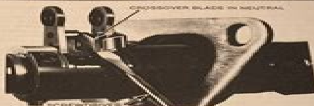
Holding cross-over blades in neutral