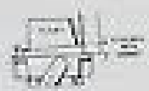
FIGURE 5. NEEDLE VALVE AND SEAT