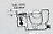
FIGURE 8. NEEDLE VALVE AND SEAT