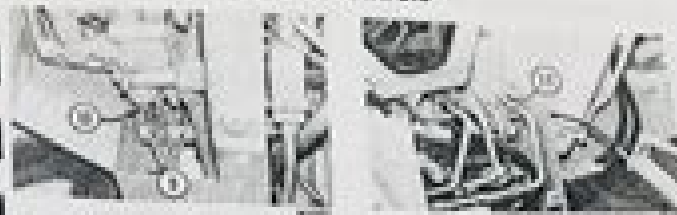
(3 - 4 Grease Fittings)