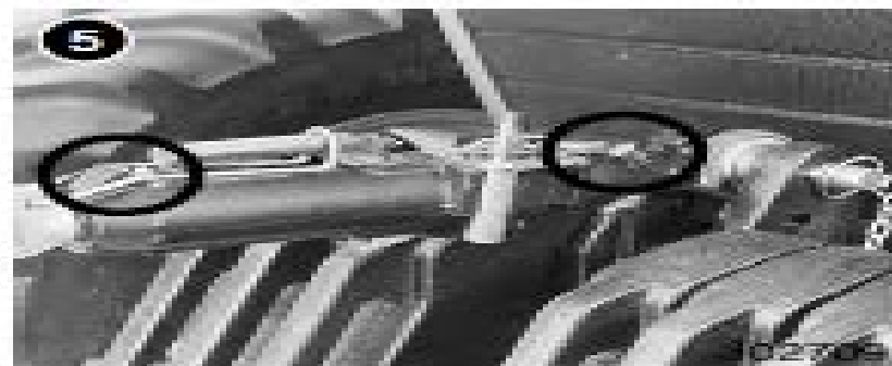
Front Hitch Top Link (if equipped)