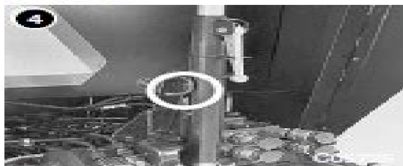
Rear Hitch Top Link