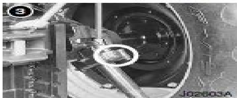
Levelling control gearbox (if equipped)