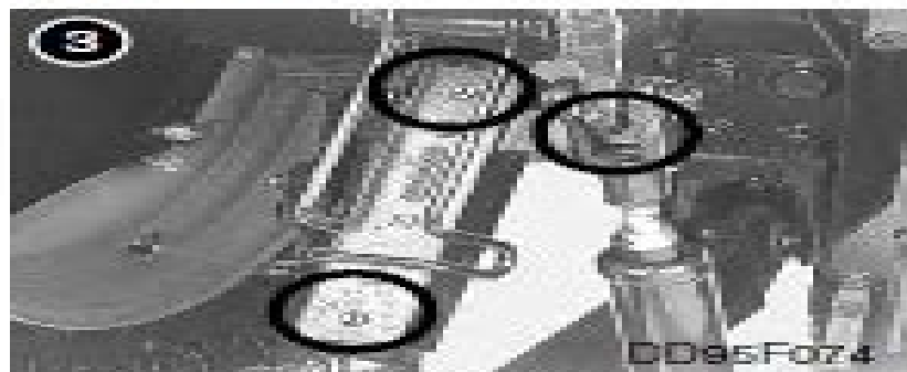
3 Point Linkage Turnbuckles and Auto Hitch Lift Links (if equipped)