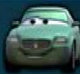
COSTANZO DELLA CORSA