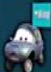
MATTHEW 'TRUE BLUE' MOORE