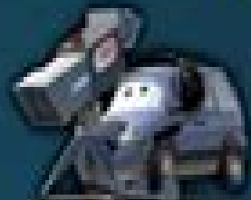
CHUCK CHOKE CABLES