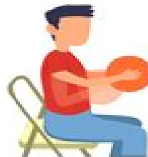
BALL CHEST PRESS