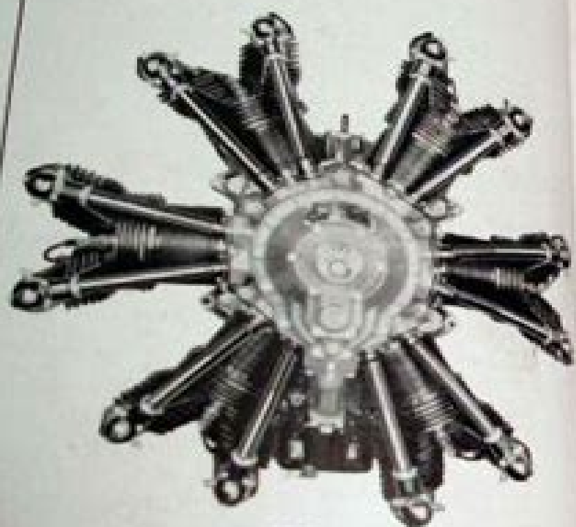
FIG. 1 PROPELLER END VIEW