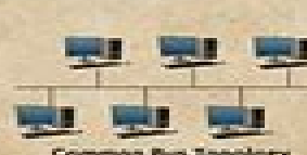
Common Bus Topology