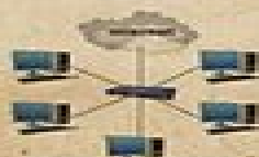
Star Network Topology