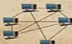
Mesh Network Topology