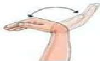
Wrist Range of Motion